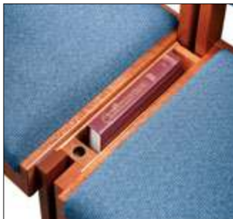
Single Side Book Rack and Cup Holder

A variety of accessory options are available for your worship environment, including book racks, card, cup or pencil holders, and kneelers.