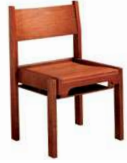
Oaklok Side Chair 2023200 (optional book rack shown)