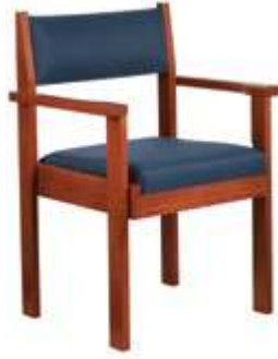
Oaklok Arm Chair 2322200