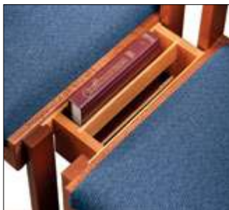
Side Double Book Rack