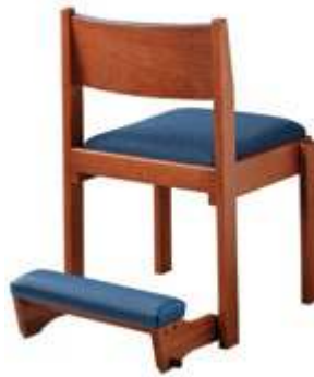
Oaklok Side Chair 2022200 (optional kneeler shown)