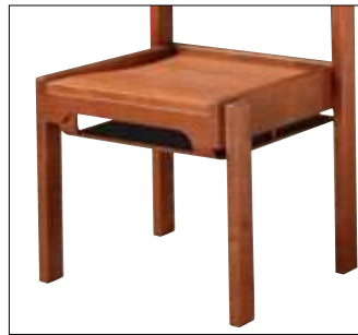
Underseat Wood Book Rack