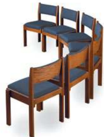
Oaklok chairs interlocked in both straight and radius rows