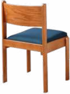
Paragon Side Chair 2022600

Oaklok and Paragon chairs are crafted to bring out the natural beauty of the wood. Clean, straight lines and a choice of wood or upholstered options allow these chairs to be used in worship environments.