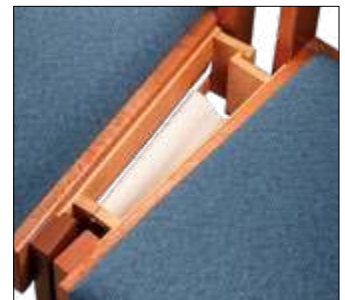
Single Radius Book Rack