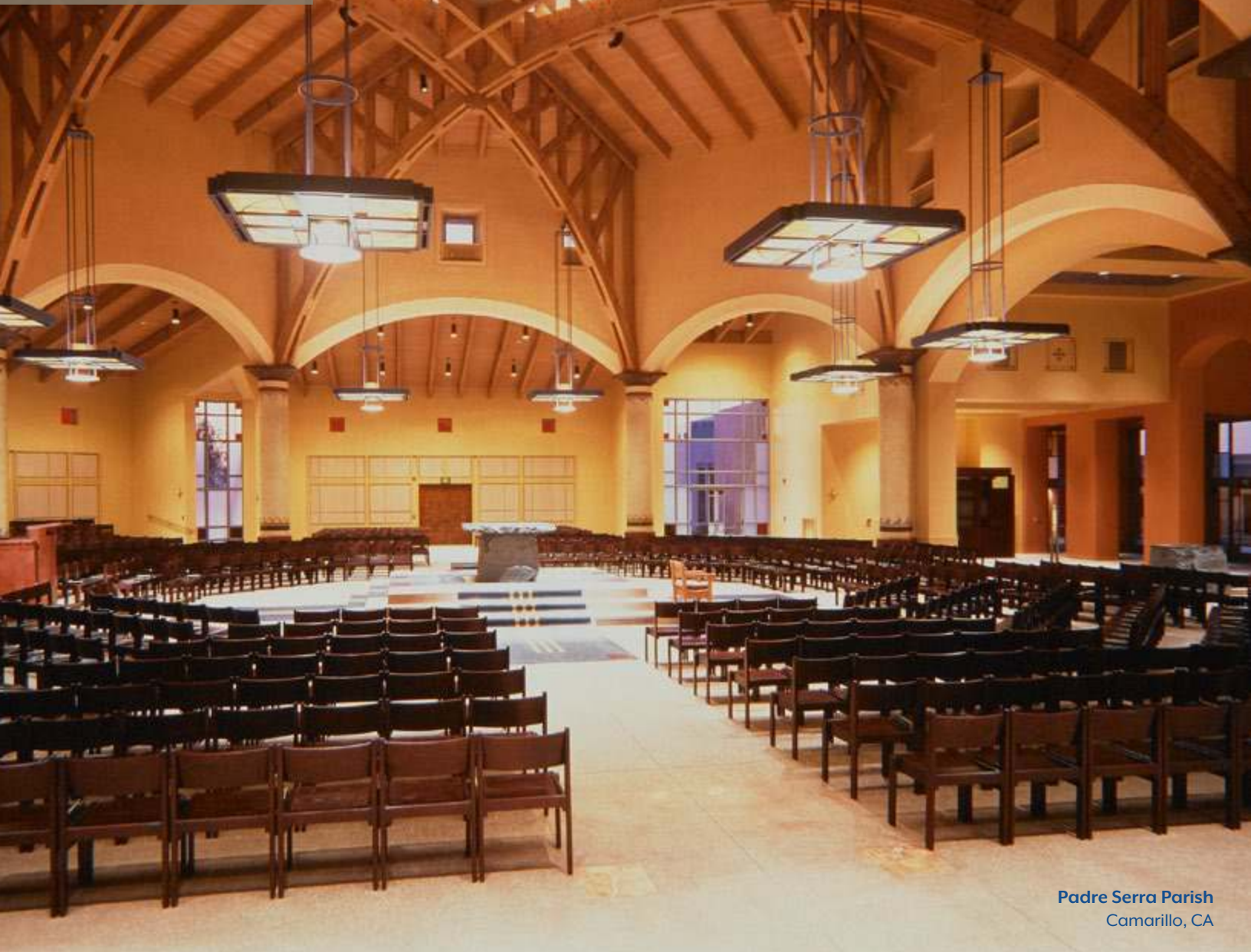
Padre Serra Parish Camarillo, CA

We invite you to discover furniture for the way you worship like over 35,000 churches, synagogues, courthouses and funeral homes already know - the Sauder Worship Seating® difference. For additional information, please visit sauderworship.com or contact your local sales consultant.