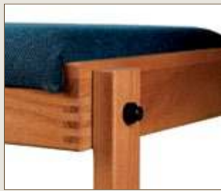
Finger-jointed ensures strength and durability