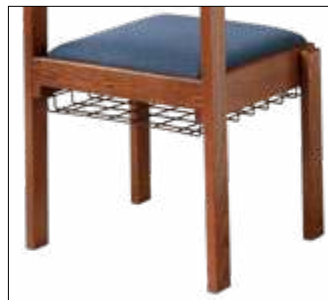
Underseat Wire Book Rack