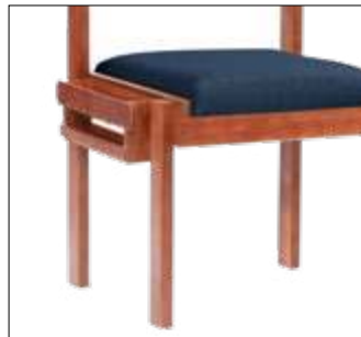
Single Side Book Rack