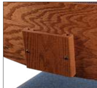
Card and Pencil Holder