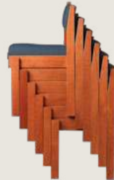
Oaklok and Paragon chairs stack 7 high for convenient storage. Arm chairs stack 4 high.